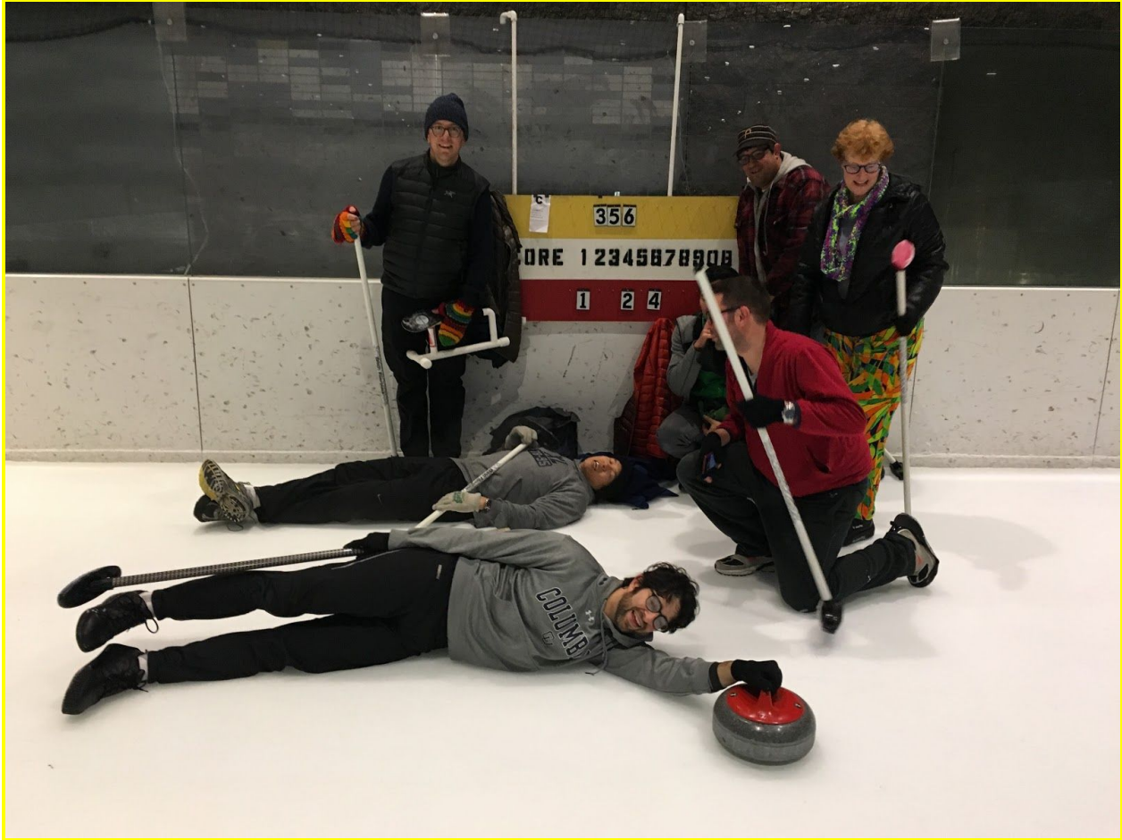
ICY DEAD PEOPLE.... THEY DON'T KNOW THEY ARE RED..... THEY WANT ME TO HELP THEM.....