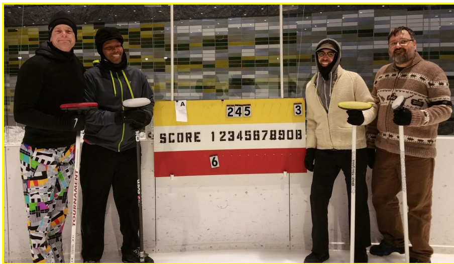
League Shocked by Omoy's Fashion Understatement

^^ subject to change to insure no team plays sheet X three of last 6 weeks