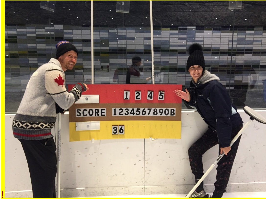
BABZ relishes a well played game