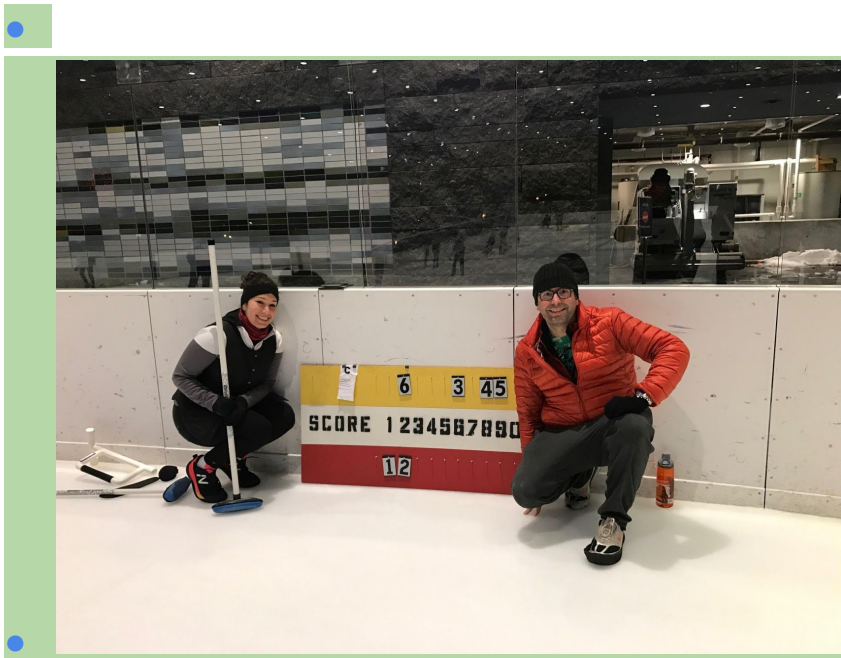
Blarney Stone Basks in the aftermath..... Six... count 'em..... SIX!