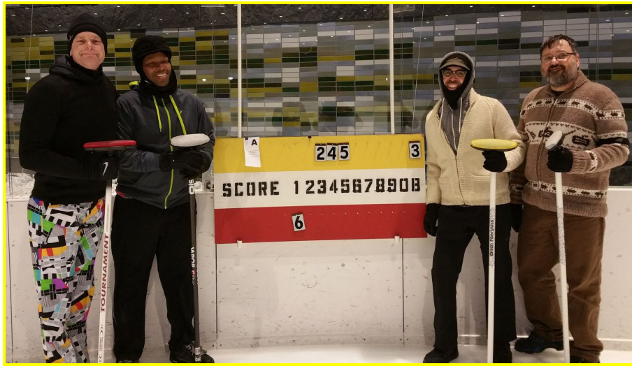
League Shocked by Omoy's Fashion Understatement