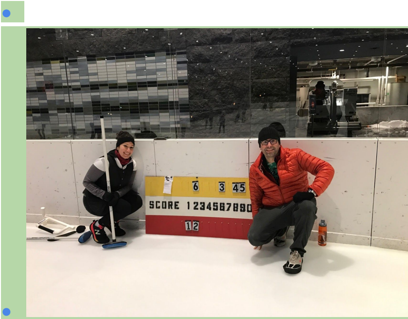
Blarney Stone Basks in the aftermath..... Six... count 'em..... SIX!