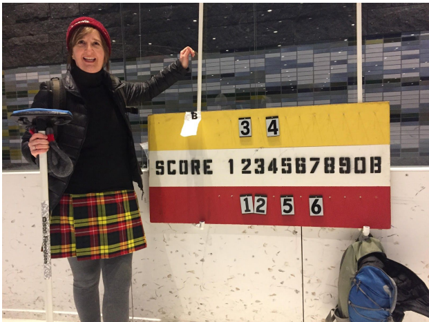
Girl Scout Troop #15 Takes the Season Record 11 Wins!