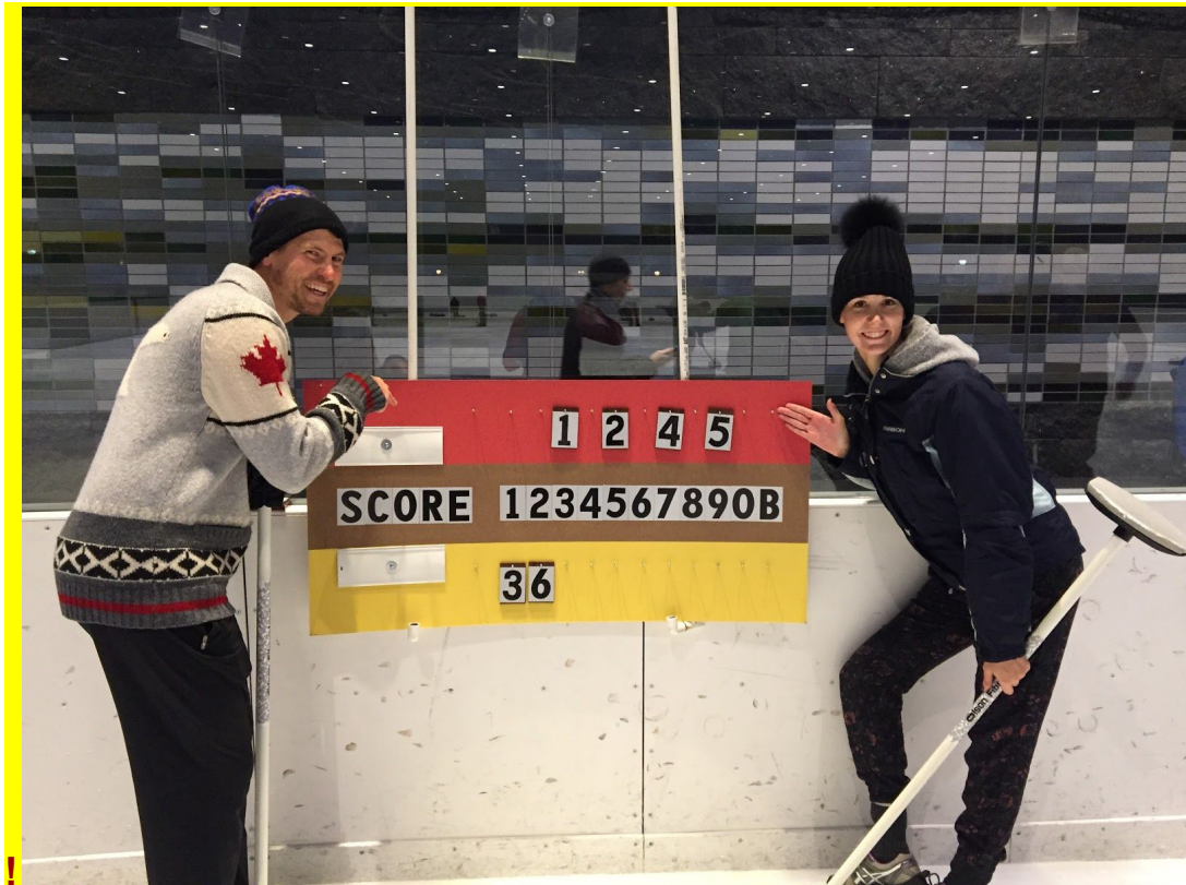
BABZ relishes a well played game