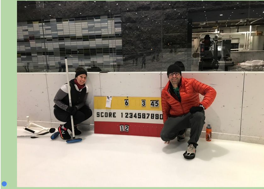
Blarney Stone Basks in the aftermath..... Six... count 'em..... SIX!